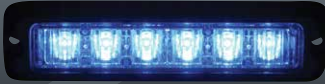
MR6-B with flush mount (included)