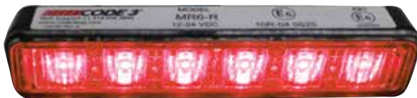
MR6 single color