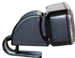
MR6 Hood Mount Bracket (Included)