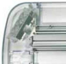
SINGLE END LED MODULE