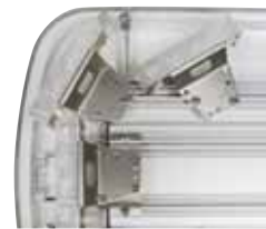
ALLEY + ANGLED MODULES