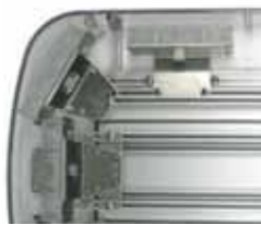
TAKEDOWN & ALLEY LED