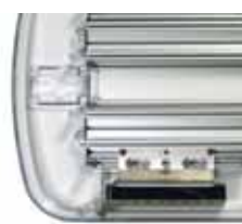
STOP/TAIL/TURN LED Combined