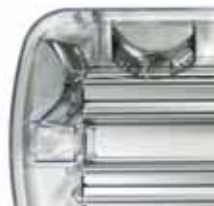
TAKEDOWN & ALLEY Halogen