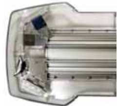
REAR ALLEY HALOGEN With 3 tier LED and single end LED