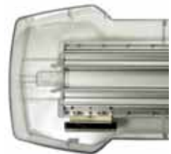
STOP/TAILO/TURN LED Combined