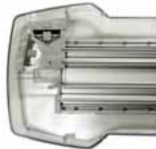
TAKEDOWN & ALLEY LED