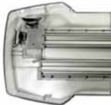
TAKEDOWN & ALLEY Halogen