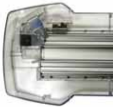
LED-E-SECTOR High power intersect/alley takedown & scene light