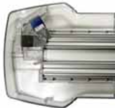
3 TIER LED MODULE