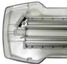
SINGLE END LED MODULE