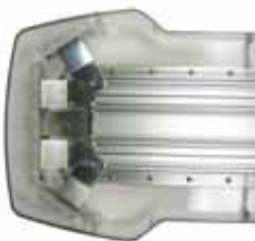
REAR ALLEY LED 3 tier module with incorporated LED Alley