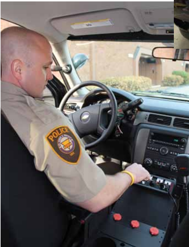
Operating the Banshee from the primary siren control head.

Code 3 C3100 Speakers are now capable of producing low frequency tones. At 6.3" x 6.3" x 3" they fit in a variety of locations.